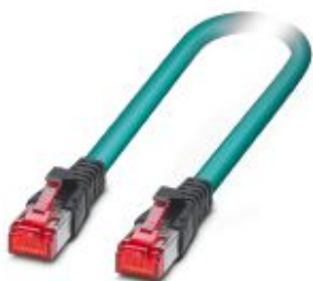
Patch cable, degree of protection: IP20, cable length: 10 m, number of positions: 8, 10 Gbps, CAT6 A

Please be informed that the data shown in this PDF Document is generated from our Online Catalog. Please find the complete data in the user's documentation. Our General Terms of Use for Downloads are valid ( http://phoenixcontact.com/download )