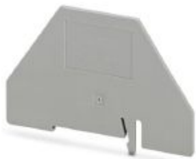
Partition plate, length: 83 mm, width: 2 mm, height: 60 mm, color: gray

Please be informed that the data shown in this PDF Document is generated from our Online Catalog. Please find the complete data in the user's documentation. Our General Terms of Use for Downloads are valid ( http://phoenixcontact.com/download )