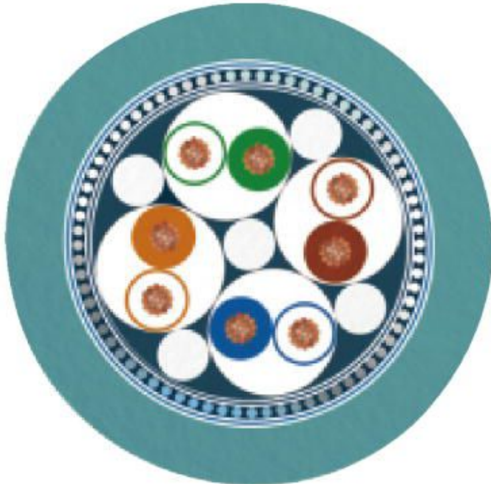
Cable cross section