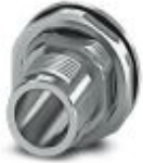
Sample set, Plug, M12-SPEEDCON, Rear mounting, M15 x 1

Sample set - SACC-BP-M-M12/M15-6-THR SCO SP - 1421844