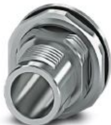
M12 SPEEDCON housing screw connection for M12 male inserts, with O-ring, for all SPEEDCON-capable THR and wave soldering contact carriers

Please be informed that the data shown in this PDF Document is generated from our Online Catalog. Please find the complete data in the user's documentation. Our General Terms of Use for Downloads are valid ( http://phoenixcontact.com/download )