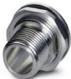
Housing screw connection, Plug, M12, Rear mounting, M15 x 1

Please be informed that the data shown in this PDF Document is generated from our Online Catalog. Please find the complete data in the user's documentation. Our General Terms of Use for Downloads are valid ( http://phoenixcontact.com/download )