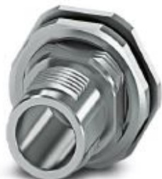
Housing screw connection, Plug, M12-SPEEDCON, Rear mounting, M15 x 1

Please be informed that the data shown in this PDF Document is generated from our Online Catalog. Please find the complete data in the user's documentation. Our General Terms of Use for Downloads are valid ( http://phoenixcontact.com/download )