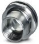
Sample set, Socket, M12, Rear mounting, M15 x 1

Sample set - SACC-BP-F-M12/M15-6-THR SP - 1421801