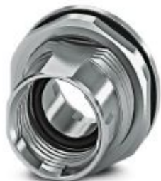
Housing screw connection, Socket, M12-SPEEDCON, Rear mounting, M15 x 1

Please be informed that the data shown in this PDF Document is generated from our Online Catalog. Please find the complete data in the user's documentation. Our General Terms of Use for Downloads are valid ( http://phoenixcontact.com/download )