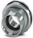
Sample set, Socket, M12-SPEEDCON, Rear mounting, M15 x 1

Sample set - SACC-BP-F-M12/M15-6-THR SCO SP - 1421843