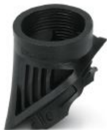
Adapter, plastic, for EVO housing, M32 thread

Please be informed that the data shown in this PDF Document is generated from our Online Catalog. Please find the complete data in the user's documentation. Our General Terms of Use for Downloads are valid ( http://phoenixcontact.com/download )