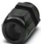
Cable gland, cable gland material: PA, external cable diameter 18 mm ... 25 mm, shielding: no, connecting thread: M32 x 1.5, color: jet black RAL 9005

Cable gland - G-INS-M32-L68N-PNES-BK - 1424483