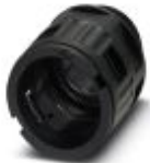
Cable gland, metric thread, IP66 protection, straight

Screw connection - WP-G HF IP66 M32 BK - 3240900