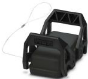
Protective cover B10, with double locking latch, protective cover material: PA, height: 21.6 mm, seal: yes, diameter of retaining cord eyelet: 30 mm

Please be informed that the data shown in this PDF Document is generated from our Online Catalog. Please find the complete data in the user's documentation. Our General Terms of Use for Downloads are valid ( http://phoenixcontact.com/download )