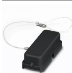
Protective cover D15, for single locking latch, protective cover material: PA, height: 20.5 mm, seal: yes

Please be informed that the data shown in this PDF Document is generated from our Online Catalog. Please find the complete data in the user's documentation. Our General Terms of Use for Downloads are valid ( http://phoenixcontact.com/download )