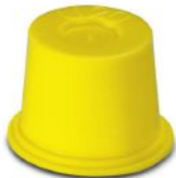
Protective cap plastic, for QPD-QUICKON connection 3(4) x 1.5 mm 2 , IP50

Please be informed that the data shown in this PDF Document is generated from our Online Catalog. Please find the complete data in the user's documentation. Our General Terms of Use for Downloads are valid ( http://phoenixcontact.com/download )