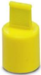
Protective cap plastic, for QPD-QUICKON connection 3(4)x 1.5 mm 2 , IP50

Please be informed that the data shown in this PDF Document is generated from our Online Catalog. Please find the complete data in the user's documentation. Our General Terms of Use for Downloads are valid ( http://phoenixcontact.com/download )