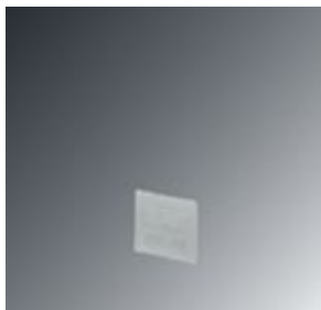
End cover, length: 28 mm, width: 1 mm, height: 26.2 mm, color: gray

Please be informed that the data shown in this PDF Document is generated from our Online Catalog. Please find the complete data in the user's documentation. Our General Terms of Use for Downloads are valid ( http://phoenixcontact.com/download )