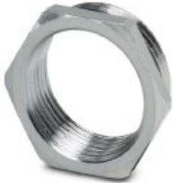
Reducing adapter, material: Brass, nickel-plated, connecting thread: Pg21, color: silver, with O-ring

Please be informed that the data shown in this PDF Document is generated from our Online Catalog. Please find the complete data in the user's documentation. Our General Terms of Use for Downloads are valid ( http://phoenixcontact.com/download )