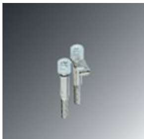
Switching bridge, 2-pos.

Please be informed that the data shown in this PDF Document is generated from our Online Catalog. Please find the complete data in the user's documentation. Our General Terms of Use for Downloads are valid ( http://phoenixcontact.com/download )