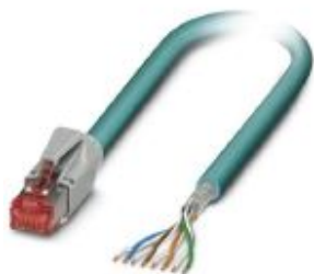
Assembled Ethernet cable, CAT6, shielded, 4-pair, AWG 26 stranded (7-wire), RAL 5021 (water blue), RJ45 plug/IP20 on free conductor end, line, length 2 m

Please be informed that the data shown in this PDF Document is generated from our Online Catalog. Please find the complete data in the user's documentation. Our General Terms of Use for Downloads are valid ( http://phoenixcontact.com/download )