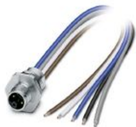
Flush-type connector, Power, 5-position, Plug, M12, L - Power, Front mounting, M16 x 1.5, Individual wires, cable length: 0.2 m, 2.50 mm 2 , PEX litz wire

Please be informed that the data shown in this PDF Document is generated from our Online Catalog. Please find the complete data in the user's documentation. Our General Terms of Use for Downloads are valid ( http://phoenixcontact.com/download )