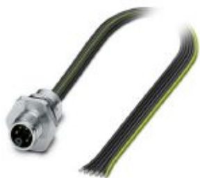
Flush-type connector, Power, 6-position, Plug, M12, M - Power, Front mounting, M16 x 1.5, Individual wires, cable length: 0.2 m, 1.31 mm 2 , UL/cUL stranded hook-up wire

Please be informed that the data shown in this PDF Document is generated from our Online Catalog. Please find the complete data in the user's documentation. Our General Terms of Use for Downloads are valid ( http://phoenixcontact.com/download )