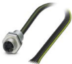
Flush-type connector, Power, 6-position, Socket, M12, M - Power, Front mounting, M16 x 1.5, Individual wires, cable length: 0.2 m, 1.31 mm 2 , UL/cUL stranded hook-up wire

Please be informed that the data shown in this PDF Document is generated from our Online Catalog. Please find the complete data in the user's documentation. Our General Terms of Use for Downloads are valid ( http://phoenixcontact.com/download )