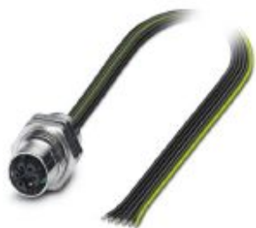
Flush-type connector, Power, 6-position, Socket, M12, M - Power, Rear mounting, M16 x 1.5, Individual wires, cable length: 0.2 m, 1.31 mm 2 , UL/cUL stranded hook-up wire

Please be informed that the data shown in this PDF Document is generated from our Online Catalog. Please find the complete data in the user's documentation. Our General Terms of Use for Downloads are valid ( http://phoenixcontact.com/download )