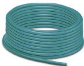
Network cable, Ethernet CAT5 (1 Gbps), 8-position, PUR, water blue RAL 5021, shielded, free cable end, on free cable end, cable length: 100 m

Please be informed that the data shown in this PDF Document is generated from our Online Catalog. Please find the complete data in the user's documentation. Our General Terms of Use for Downloads are valid ( http://phoenixcontact.com/download )