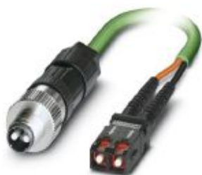
FO connecting cable, degree of protection: IP65/IP67, number of positions: 2, connection method: M12 circular connector

Please be informed that the data shown in this PDF Document is generated from our Online Catalog. Please find the complete data in the user's documentation. Our General Terms of Use for Downloads are valid ( http://phoenixcontact.com/download )