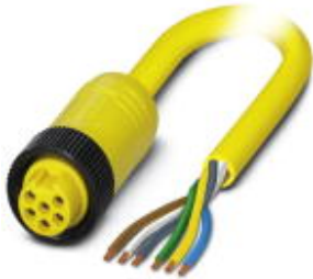
Power cable, 6-position, PVC, yellow, free cable end, on Socket straight 7/8"-16UNF, Cable length: 5 m

Please be informed that the data shown in this PDF Document is generated from our Online Catalog. Please find the complete data in the user's documentation. Our General Terms of Use for Downloads are valid ( http://phoenixcontact.com/download )