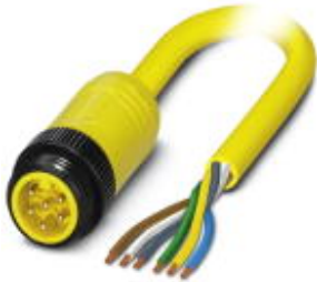
Power cable, 6-position, PVC, yellow, Plug straight 7/8"-16UNF, on free cable end, Cable length: 5 m

Please be informed that the data shown in this PDF Document is generated from our Online Catalog. Please find the complete data in the user's documentation. Our General Terms of Use for Downloads are valid ( http://phoenixcontact.com/download )