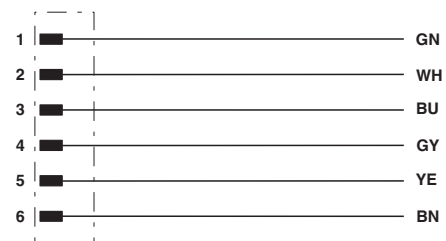
Contact assignment of the 7/8" connector and the 7/8" socket