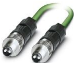
Assembled FO cable, round cable, 200/230 µm PCF-GI fiber, M12 to M12, for installation inside buildings, length: 5 m

Please be informed that the data shown in this PDF Document is generated from our Online Catalog. Please find the complete data in the user's documentation. Our General Terms of Use for Downloads are valid ( http://phoenixcontact.com/download )