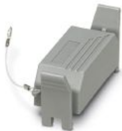
IP67 protective cover

Please be informed that the data shown in this PDF Document is generated from our Online Catalog. Please find the complete data in the user's documentation. Our General Terms of Use for Downloads are valid ( http://phoenixcontact.com/download )