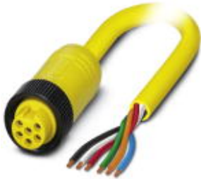
Power cable, 6-position, PVC, yellow, free cable end, on Socket straight 7/8"-16UNF, Cable length: 10 m

Please be informed that the data shown in this PDF Document is generated from our Online Catalog. Please find the complete data in the user's documentation. Our General Terms of Use for Downloads are valid ( http://phoenixcontact.com/download )