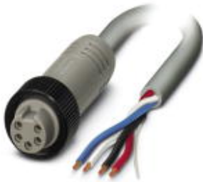
Bus system cable, DeviceNet™, 5-position, PVC, gray, free cable end, on Socket straight 7/8"-16UNF, Cable length: 5 m

Please be informed that the data shown in this PDF Document is generated from our Online Catalog. Please find the complete data in the user's documentation. Our General Terms of Use for Downloads are valid ( http://phoenixcontact.com/download )