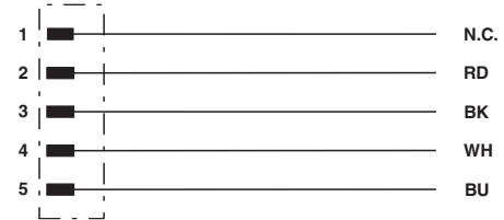
Contact assignment of the 7/8" connector and the 7/8" socket