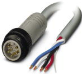
Bus system cable, DeviceNet™, 5-position, PVC, gray, Plug straight 7/8"-16UNF, on free cable end, Cable length: 5 m

Please be informed that the data shown in this PDF Document is generated from our Online Catalog. Please find the complete data in the user's documentation. Our General Terms of Use for Downloads are valid ( http://phoenixcontact.com/download )