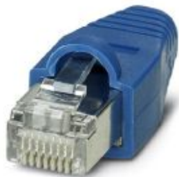
RJ45 plug, CAT5e, 8-pos., shielded, IDC connection technology, for litz wire and solid 26...24 AWG wire, with blue bend protection sleeve

Please be informed that the data shown in this PDF Document is generated from our Online Catalog. Please find the complete data in the user's documentation. Our General Terms of Use for Downloads are valid ( http://phoenixcontact.com/download )