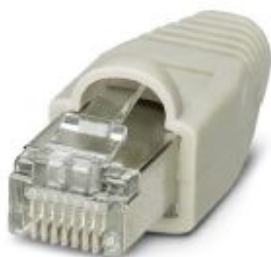
RJ45 plug, CAT5e, 8-pos., shielded, IDC connection technology, for litz wire and solid 26...24 AWG wire, with gray bend protection sleeve

Please be informed that the data shown in this PDF Document is generated from our Online Catalog. Please find the complete data in the user's documentation. Our General Terms of Use for Downloads are valid ( http://phoenixcontact.com/download )