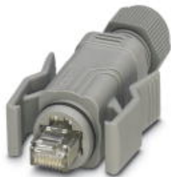
RJ45 connector, IP67, CAT5e, 8-pos., with QUICKON fast connection technology, for 1-wire and 7-wire conductors AWG 26 ... 23, for cable diameter of 5.0 mm ... 8.0 mm, TIA 568 A labeling, color: gray

Please be informed that the data shown in this PDF Document is generated from our Online Catalog. Please find the complete data in the user's documentation. Our General Terms of Use for Downloads are valid ( http://phoenixcontact.com/download )