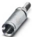
Coding socket for coding up to 16 connectors, for HC Modular