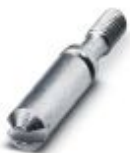
Coding peg for coding up to 16 connectors, for HC Modular