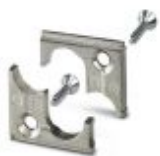
Adapter, application: Shield adapters