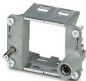
Module carrier frame, size: B6, type : for the panel mounting side (a, b, c, ...) V, 4 mm 2 ... 6 mm 2 , application: Module carrier frame

Please be informed that the data shown in this PDF Document is generated from our Online Catalog. Please find the complete data in the user's documentation. Our General Terms of Use for Downloads are valid ( http://phoenixcontact.com/download )