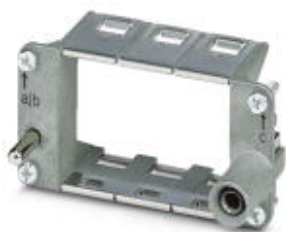
Module carrier frame, size: B10, type : for the panel mounting side (a, b, c, ...) V, 4 mm 2 ... 6 mm 2 , application: Module carrier frame

Please be informed that the data shown in this PDF Document is generated from our Online Catalog. Please find the complete data in the user's documentation. Our General Terms of Use for Downloads are valid ( http://phoenixcontact.com/download )