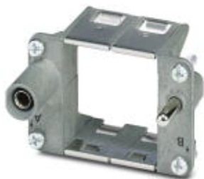
Module carrier frame, size: B6, type : for the sleeve side (A, B, C, ...) V, 4 mm 2 ... 6 mm 2 , application: Module carrier frame

Please be informed that the data shown in this PDF Document is generated from our Online Catalog. Please find the complete data in the user's documentation. Our General Terms of Use for Downloads are valid ( http://phoenixcontact.com/download )