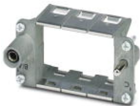
Module carrier frame, size: B10, type : for the sleeve side (A, B, C, ...) V, 4 mm 2 ... 6 mm 2 , application: Module carrier frame

Please be informed that the data shown in this PDF Document is generated from our Online Catalog. Please find the complete data in the user's documentation. Our General Terms of Use for Downloads are valid ( http://phoenixcontact.com/download )