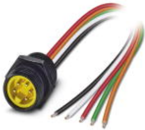
Sensor/actuator flush-type plug, 5-pos., 7/8", front mounting with 7/8" fastening thread, with 1.0 m PE litz wire

Please be informed that the data shown in this PDF Document is generated from our Online Catalog. Please find the complete data in the user's documentation. Our General Terms of Use for Downloads are valid ( http://phoenixcontact.com/download )