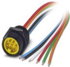
Sensor/actuator flush-type plug, 6-pos., 7/8", front mounting with 7/8" fastening thread, with 1.0 m PE litz wire

Please be informed that the data shown in this PDF Document is generated from our Online Catalog. Please find the complete data in the user's documentation. Our General Terms of Use for Downloads are valid ( http://phoenixcontact.com/download )