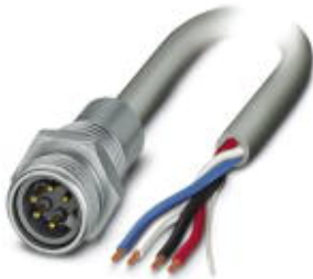
DeviceNet™ thin flush-type plug, 5-pos., 7/8", front mounting with 7/8" fastening thread, with 1.0 m PE litz wire

Please be informed that the data shown in this PDF Document is generated from our Online Catalog. Please find the complete data in the user's documentation. Our General Terms of Use for Downloads are valid ( http://phoenixcontact.com/download )