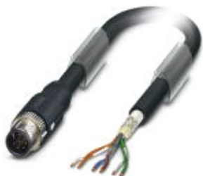
Bus system cable, VARAN, 6-position, PVC, black, shielded, Plug straight M12 SPEEDCON, A-coded, on free cable end, cable length: 1.5 m, Customer version

Please be informed that the data shown in this PDF Document is generated from our Online Catalog. Please find the complete data in the user's documentation. Our General Terms of Use for Downloads are valid ( http://phoenixcontact.com/download )