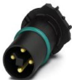
Flush-type connector, Power, 4-position, Plug, straight, T power, PCB mounting, THR solder connection

Please be informed that the data shown in this PDF Document is generated from our Online Catalog. Please find the complete data in the user's documentation. Our General Terms of Use for Downloads are valid ( http://phoenixcontact.com/download )