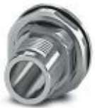
M12 SPEEDCON housing screw connection for M12 male inserts, with O-ring, for all SPEEDCON-capable THR and wave soldering contact carriers

Housing screw connection - SACC-BP-M-M12/M15-6-THR SCO - 1413999