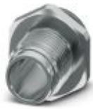
Housing screw connection, Plug, M12-Push-Pull, Front mounting, THR- und Wellenlötkontakte

Housing screw connection - SACC-FP-M-M12-THR PP - 1027679