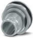
Housing screw connection, Plug, M12-Push-Pull, Rear mounting, THR- und Wellenlötkontakte

Housing screw connection - SACC-BP-M-M12-THR PP - 1027661