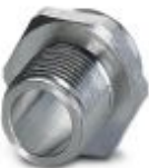
M12 pin, front mounting THR with M14 screw fastening

Housing screw connection - SACC-DSIV-M12-PLUG-9 THR - 1417984