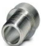
M12 pin, housing screw connection, press-in version, for all Speedcon-compatible THR and wave soldering contact carriers

Housing screw connection - SACC-M12 PLUG PRESS - 1437892