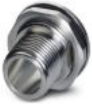
Housing screw connection, Plug, M12, Rear mounting, M15 x 1

Housing screw connection - SACC-BP-M-M12/M15-7-THR - 1413996