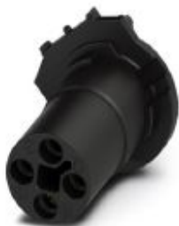
Flush-type connector, Power, 4-position, Socket, straight, T power, PCB mounting, THR solder connection

Please be informed that the data shown in this PDF Document is generated from our Online Catalog. Please find the complete data in the user's documentation. Our General Terms of Use for Downloads are valid ( http://phoenixcontact.com/download )