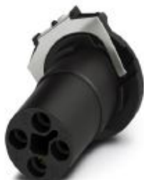
Flush-type connector, Power, 4-position, Socket, straight, M12, T power, PCB mounting, THR solder connection

Please be informed that the data shown in this PDF Document is generated from our Online Catalog. Please find the complete data in the user's documentation. Our General Terms of Use for Downloads are valid ( http://phoenixcontact.com/download )