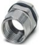
M12-SPEEDCON housing screw connection for M12 female inserts, with flat gasket, for all Speedcon-compatible THR and wave soldering contact carriers

Housing screw connection - SACC-M12-SCO NUT L 90 - 1432460