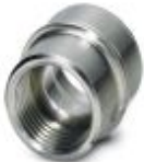
Housing screw connection for two-piece M12 connectors for the reflow soldering process.

Housing screw connection - SACC-M12 NUT PRESS - 1437889