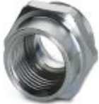
M12 female connector, front mounting THR with M14 screw fastening

Housing screw connection - SACC-DSIV-M12-NUT-9 THR - 1417989