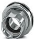
Housing screw connection, Socket, M12-SPEEDCON, Rear mounting, M15 x 1

Housing screw connection - SACC-BP-F-M12/M15-6-THR SCO - 1414020