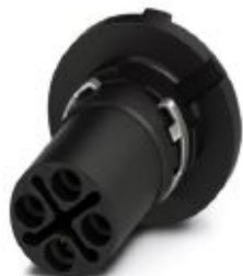
Flush-type connector, Universal, 4-position, Socket, straight, S power, PCB mounting, THR solder connection

Please be informed that the data shown in this PDF Document is generated from our Online Catalog. Please find the complete data in the user's documentation. Our General Terms of Use for Downloads are valid ( http://phoenixcontact.com/download )