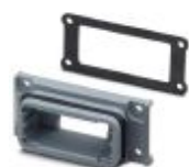
D-SUB panel mounting frame, shell size 1, IP67 degree of protection

D-SUB panel mounting frames - VS-09-A - 1688366