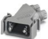
D-SUB sleeve housing, shell size 2, IP67 degree of protection

D-SUB sleeve housings - VS-15-T-2PG11 - 1688052