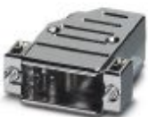
D-SUB sleeve housings, type: D-SUB 15, degree of protection: IP20, material: ABS, cable outlet: Angled, size of housing: 2, color: Bare metallic

D-SUB sleeve housings - VS-15-T-20-1-S-A - 1655687