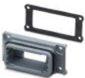
D-SUB panel mounting frame, shell size 1, IP67 degree of protection

D-SUB panel mounting frames - VS-09-A - 1688366