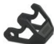
Replacement latch for HC-D7 housing

Housing brackets - HC-D07-SL-PLBK - 1424440